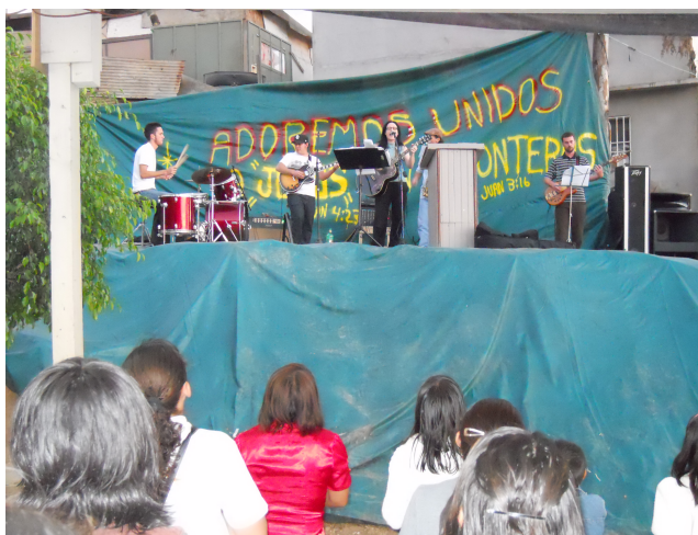
Leading worship with partners in Tijuana. "Worship without borders"

Every month, VOB sponsors Place o.f Worship San Diego. P.o.W. exists to advance the Kingdom of GOD, through worship and intercession. The goal of our gatherings, is to worship the King of kings & the Lord of lords, partnering with Him, as we worship, to prophetically promote the causes and presence of the Lord Jesus Christ. We do this through music, intercession, Scripture reading, prophetic art & dance. We also fully believe that each person who attends, should be able to contribute, in whatever way they can, as the Lord leads. So we open things up for others to participate throughout the evening. We specifically invite artists, dancers & intercessors, to come & be with us, knowing that, without the full Body of Christ, we cannot move forward. In addition, we collect non-perishable food items, for the needy, as part of our 'worship and compassion' mandate. Our priorities: Worship the Lord, prayer for the nations, food for the needy.