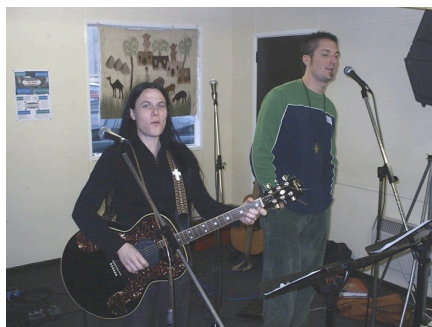
Worship in No. Ireland