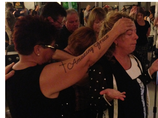
Praying for a missionary to India.