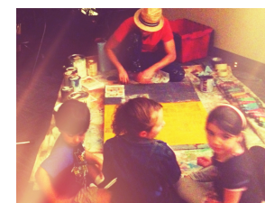
Incorporating the arts.