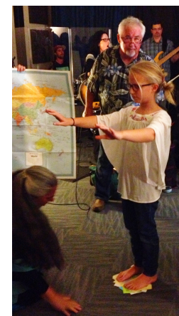
Valuing the generations.