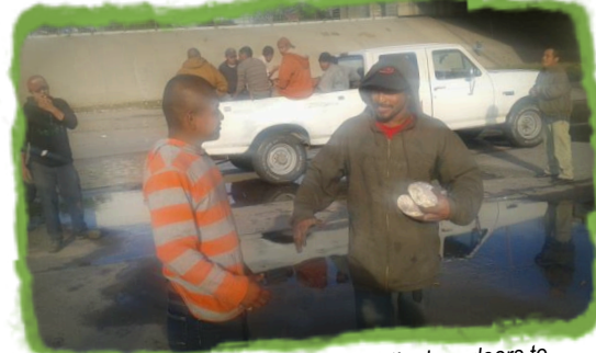
This guy took us behind one of the levy doors to show us where he and so many others live. Others wait on the truck to go to the new rehab.