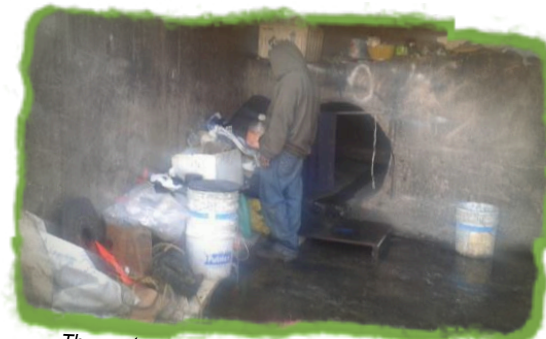
The contaminated water from all over TJ runs through these tunnels where they sleep.