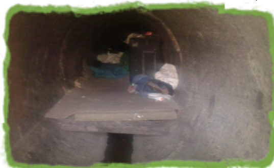
You would think it would not be that hard to convince someone to go to the rehab for a warm clean bed. Addiction is a powerful force.